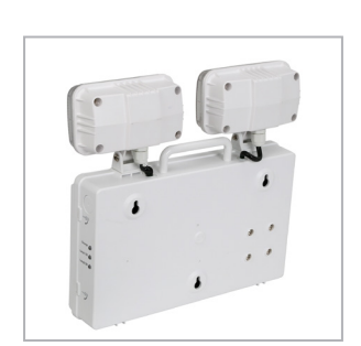
KEYHOLES ON REAR FOR WALL MOUNTING